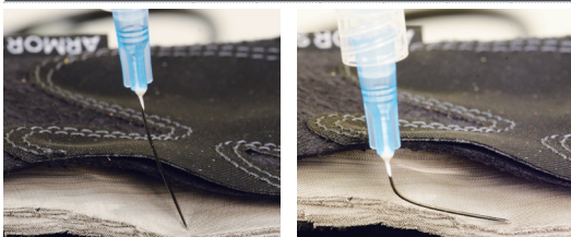
25 gauge needle buckling