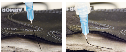
25 gauge needle buckling